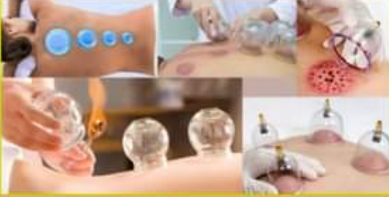
CUPPING THERAPY AND IT'S BENEFITS